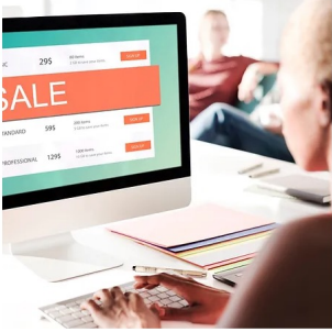
E-commerce Email Marketing Low Price ₹8,500.00