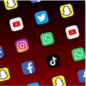
Social Media Marketing ₹24,850.00