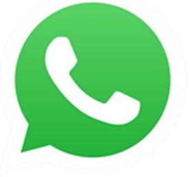
WhatsApp Marketing Campaign Group Tools Low Price ₹9.58 ₹0.46