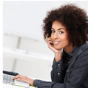
Virtual Assistant ₹18,500.00