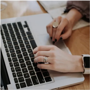
B2B Email Marketing Low Price ₹4,800.00