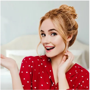
Instagram Model Influencer Modeling Agency ₹3,850.00